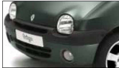
AAG930 (PHOTO 2)