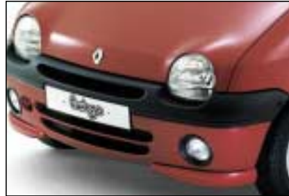
AAC231 (PHOTO 1)